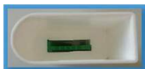
SINGLE CONVEYOR WITH MANUAL INSERTION

30/0012_ (body) – 30/0015 (conveyor) – 30/00012-C (body with conveyor included) – 30/0003_ (trigger) – 30/0004_ (rounded lid) – 30/0004P_ 30/0009_ (flat lid)