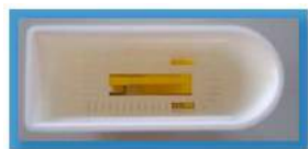
CONVEYOR ALREADY INCLUDED INTO THE MOULD